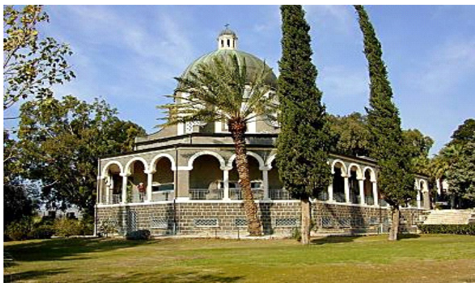
Church of the Beatitudes, northern coast of the Sea of Galilee

"Blessed are you who are poor, for yours is the kingdom of God. Blessed are you who hunger now, for you will be satisfied. Blessed are you who weep now, for you will laugh. Blessed are you when men hate you, when they exclude you and insult you and reject your name as evil, because of the Son of Man. Rejoice in that day and leap for joy, because great is your reward in heaven." (Luke 6:20-23) NIV