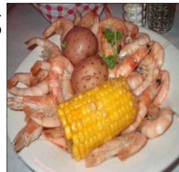
All is ready, come and enjoy it!

Tickets are $15 in advance and $17 at the door. Tickets are available at the parish office and at the door. Come with your family and friends for an enjoyable evening. Carry out available.