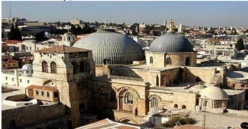
Jerusalem: Church of the Holy Sepulcher built on top of Mount Calvary where Jesus was crucified, buried and risen to life.

Yes, from this day forward all generations will call us blessed for the Almighty has called us forth from death and we have responded.