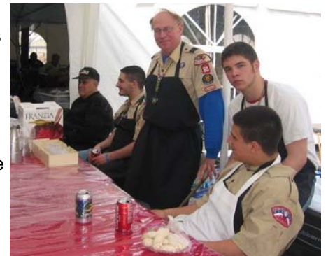
Members of Boy Scout Troop 80