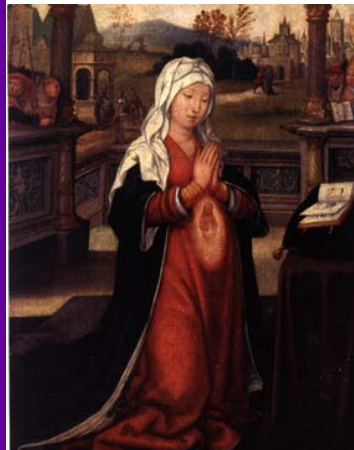
Saint Anne conceiving the Virgin Mary

In 1854, Pope Pius IX's solemn declaration, Ineffabilis Deus , clarified with finality the long-held belief of the Church that Mary