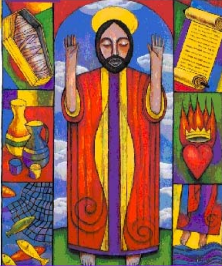
The Miracle Work Jesus Teacher, Healer, Preacher, Savior

The central character in Mark’s Gospel is Jesus of Nazareth, a miracle worker who heals the sick, frees individuals from demonic possession and manifests power over nature and even death. Jesus as an authoritative teacher, he is the Son of Man, Son of David, Lord, Messiah. Today’s reading narrates the beginning of Jesus’ public activity as a teacher and healer. The events take place in the synagogue at